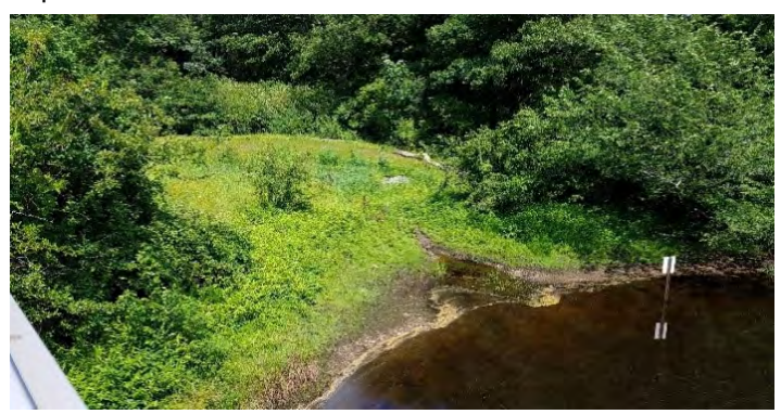
Nature-based solutions: restoration of riparian floodplain

The MVP program marks a significant shift in how communities may approach climate adaptation and resiliency planning. Unlike the predominant climate modeling and community risk assessment approach to vulnerability planning, the innovative nature of the MVP program makes an explicit commitment to identifying and implementing stakeholder-driven solutions rooted in local-level considerations. Central to this program is the idea that nature-based solutions are an integral component of healthy and climate-resilient human communities. The ability of local municipalities to deploy nature-based solutions is dependent on active engagement from individuals involved in Massachusetts conservation and regulatory planning and implementation efforts.